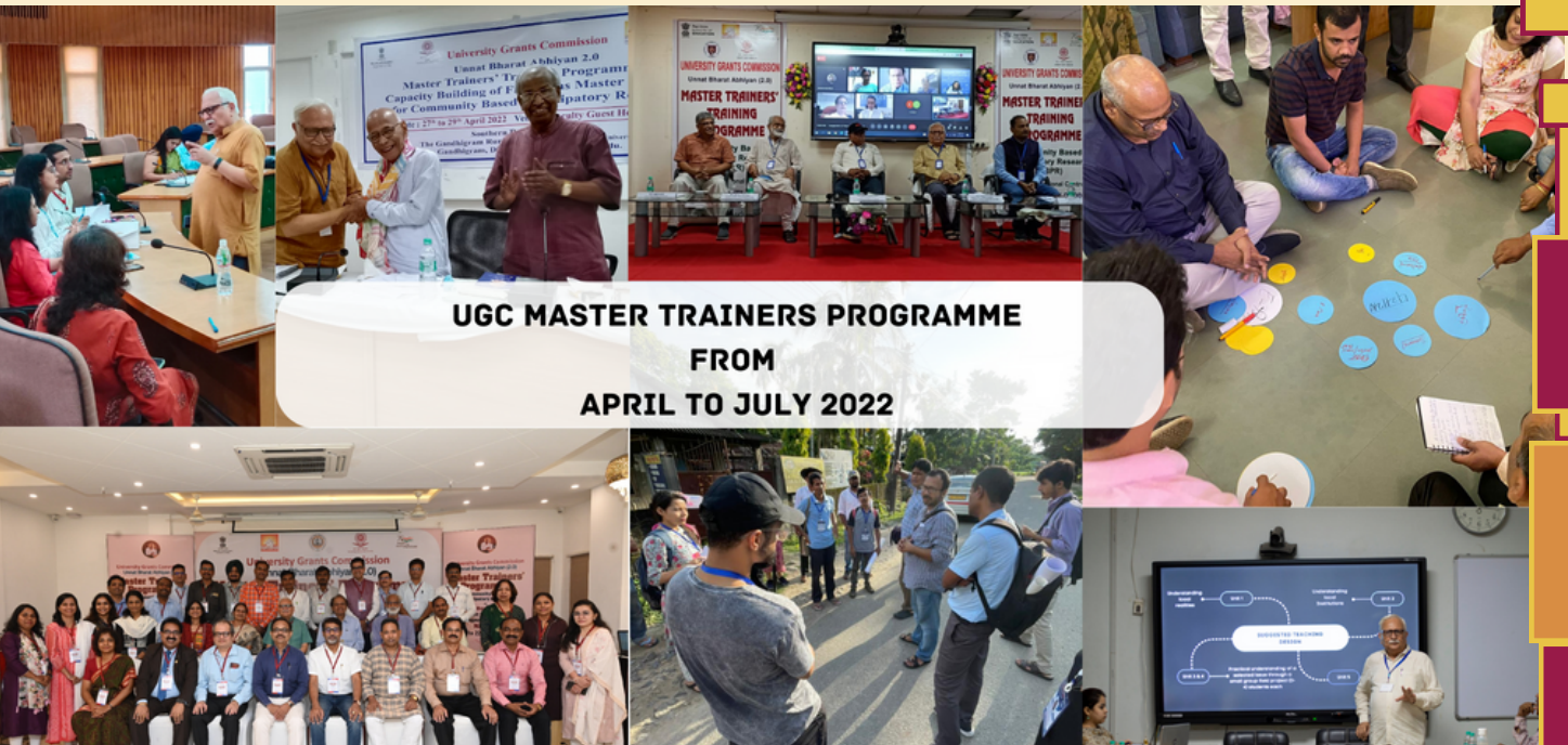
UGC MASTER TRAINERS PROGRAMME FROM APRIL TO JULY 2022

Organised in seven regional cohorts , such training provided practical skills to faculty drawn from diverse disciplines of science, engineering, agriculture, management, social sciences, public administration, etc. These trained master trainers are now training other teachers of nearby Higher Education Institutions, and starting to teach the first batch of students from the 2023 academic term. ( https://www.ugc.gov.in/pdfnews/6143521_letter-ForteringSocialresponsibility.pdf )